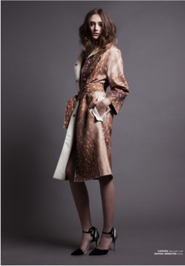
CARVEN (top) and SOPHIA WEBSTER (shoes)

Height 5' 10" Bust 32" Waist 25" Hips 34.5" Dress Size 2 Shoe Size 9 Hair Color Brown Eye Color Blue