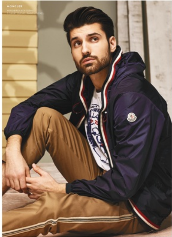
MONCLER WINDJACKET (3740) T-SHIRT (3170), PANTS (3295)