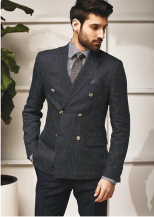
SAND COPENHAGEN BLAZER (3750), SHIRT (3225), PANTS (3295), TIE (3160), BELT (3195)

Height 6'0.5" Shirt 15" Suit/Coat 38" Waist 31" Inseam 32" Shoe Size 11 Hair Color Dark Brown Eye Color Brown